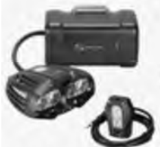
Serfas TSL Police light

Complete riding gear for all your On Duty and Off Duty needs