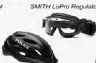
SMITH LoPro Regulator