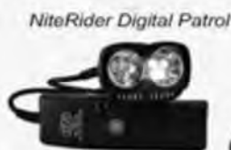
NiteRider Digital Patrol