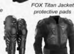
FOX Titan Jacket protective pads