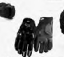
FOX BomberS gloves