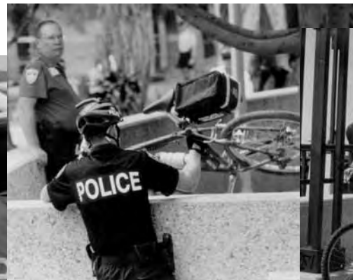
Competition, Tucson ('00)