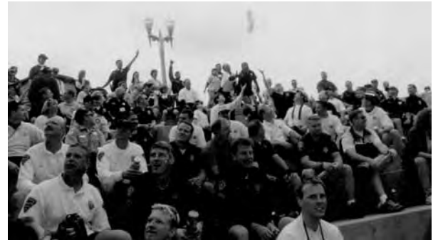
Airborne prizes, Tacoma ('98)