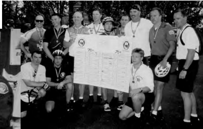
Hill Climb Champions, Cincinnati ('01)