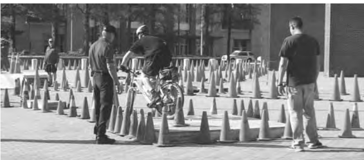
Platform slow box