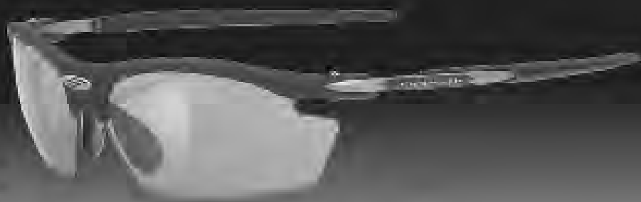
Rydon 30 Lens Choices

Choose from up to 30 lenses and 10 frame colors for our Top Performing Rydon & Genetyk Shooting Models.