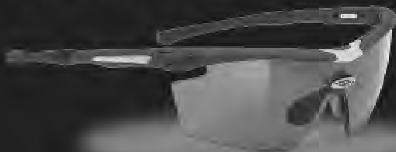
Genetyk 27 Lens Choices