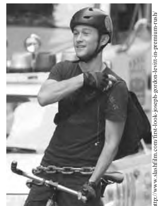
Still from Premium Rush