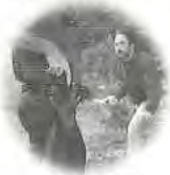
Easy to Draw