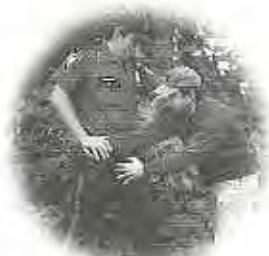
Hard to Grab