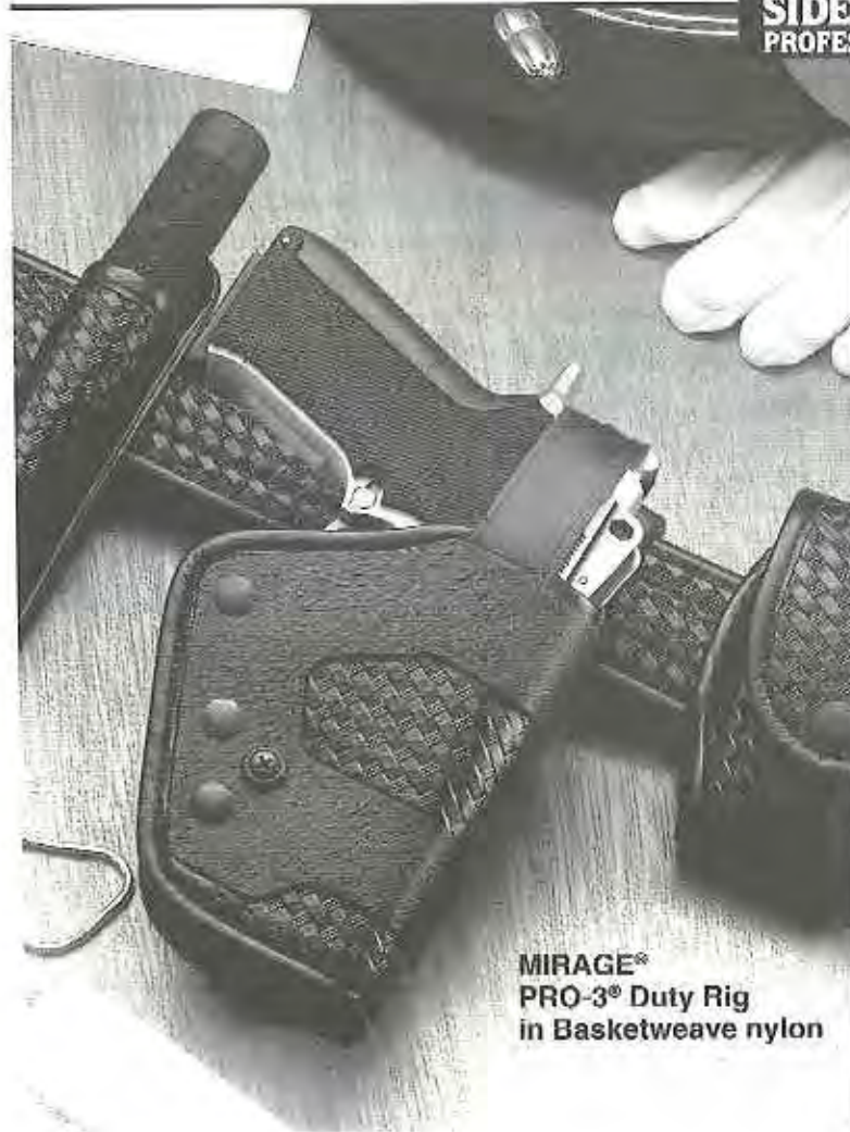
MIRAGE ® PRO-3 ® Duty Rig in Basketweave nylon

APPEARANCE. A MIRAGE duty rig starts out looking like leather, and keeps on looking sharp despite wear, dirt, moisture and rough usage.