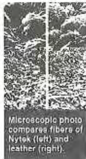
Microscopic photo compares fibers of Nyltek (left) and leather (right).

ODOR. MIRAGE products have no odor, nor will they absorb body, perfume, deodorant or any other odors. And there's never a problem from sunlight, rot, mildew or wear to the blueing on your firearm.