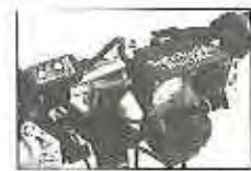
RED/WHITE CODE LIGHT