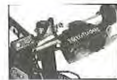
RED/BLUE WIG-WAG LIGHT