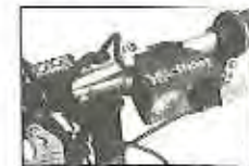
BLUE/WHITE CODE LIGHT