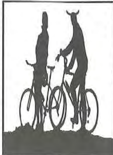
IPMBA training is no walk in the park!

During the course orientation, officers are warned: despite the coffee, tea, juice, and continental breakfast included at the rear of the room each morning—bike patrol training is not a vacation assignment. Classes start on time, and end a full eight hours later. Students can look forward to two on-bike skills tests and a 50 question written examination before being certified by both IPMBA and California’s POST. This can be a shock for officers who may have grown accustomed to enrichment or update classes which demand nothing more than being a warm body in the classroom to walk away with a training certificate.