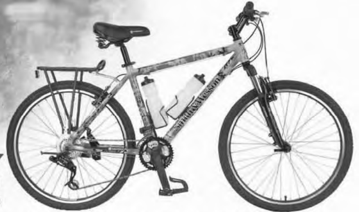
Perimeter Camo Model available February 1st, 2006