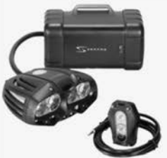
Serfas TSL Police light

Complete riding gear for all your On Duty and Off Duty needs