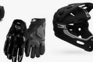
FOX BomberS gloves