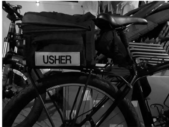
Rear Bag from Jandd (Police Rack Pack II Model)