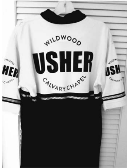
Bike-Mounted Usher Polo Shirt from MOCEAN

Safety equipment when riding bike patrol at a church is just as important as “out on the streets!” I always wear my CPSC-certified helmet, eyewear and gloves when riding at church. I also wear a ballistic vest, specifically, the armored tee shirt from Legacy Safety & Security, which is a good low-profile option for a church environment.