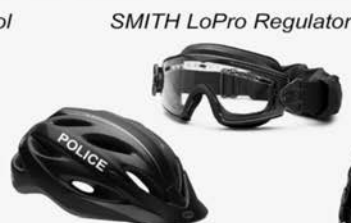
SMITH LoPro Regulator