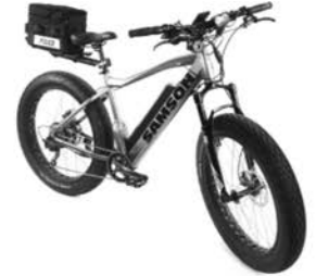
26" X 4" MODEL SQR 1