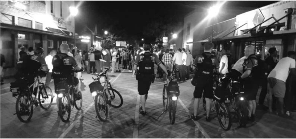
College Station Tourist Oriented Police Services Unit