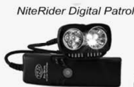
NiteRider Digital Patrol