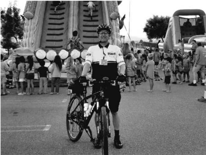
WCC's Summer Bible Blast Event, 2017

W e all know the benefits and using bicycles for public safety service delivery in a variety of environments. Police, EMS and security personnel have used bikes in many capacities for many years. They are successfully deployed in our cities, academic campuses, airports, amusement parks, casinos, hospitals, shopping malls, and more. They are effective at demonstrations, festivals, parades, concerts, and during and after disasters. But at your local church? Yes!