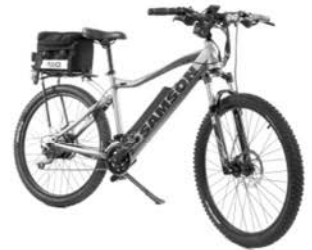
27.5" X 2.10" MODEL SPS 1