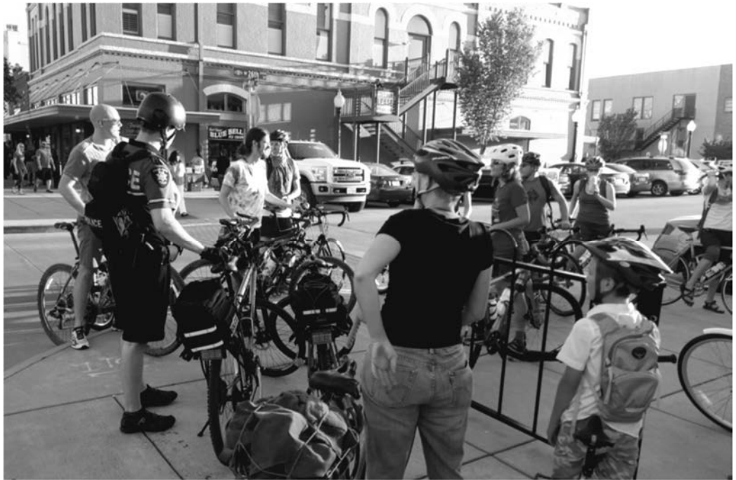
The College Station Police Department in College Station, Texas, began a concerted effort to improve relationships with patrons in the entertainment district, using bicycle patrol to do so.