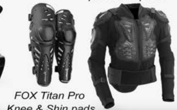
FOX Titan Pro Knee & Shin pads